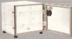
Light Transparent (PC)