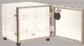
Light Transparent (PC)