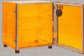
Orange Transparent (PO)