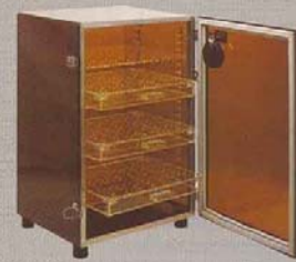
Brown Transparent (PB)