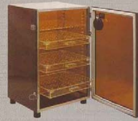
Brown Transparent (PB)