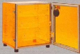
Orange Transparent (PO)